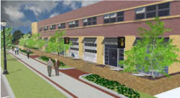
Artist's rendering special to The State

By JEFF WILKINSON - jwilkinson@thestate.com